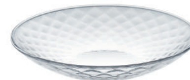
P-50305-JAN Bowl 24PCS (3x8) φ235xH45・M235 φ9¼"×H1¾"・M9¼"