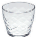
B-35104-JAN Tumbler 72PCS (3x24) φ80xH68・M80 210ml φ3½"×H2½"・M3½" 7oz