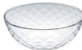
P-50322-JAN Bowl 36PCS (3x12) φ170xH65・M170 φ6¾"×H2½"・M6¾"