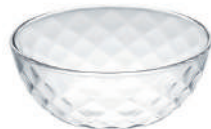
P-50323-JAN Bowl 48PCS (3x16) φ124xH50・M124 φ4¾"×H2"・M4¾"