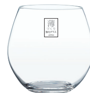
Label on Glass