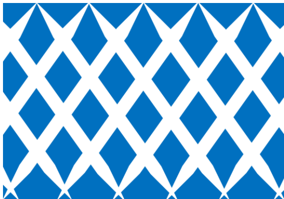
【Yarai (矢来) Pattern】

There are more than 8 basic patterns for Edo Kikiro and about 10 of them for Satsuma Kiriko. Nevertheless, as each craftsmen continuously developed their one and only unique design by combining several patterns together, there are tremendous numbers of cut designs. Each traditional patterns for Kiriko has meanings and wishes for good fortune. Yarai (矢来) for example is a pattern with grid-like design presenting the shape of a fence made of bamboo, believed to have the effect of an amulet. Kiku (菊) or Kikkamon (菊花紋), a star-like pattern of chrysanthemum express perpetual youth and longevity.