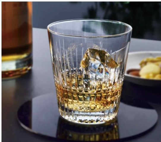
【T-20113HS-C703 with Cross Cut】