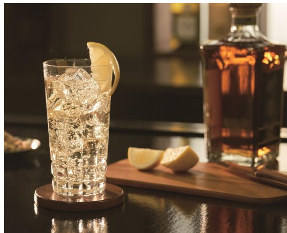
【T-20119HS-C704 with Deep Leaf Cut】

Tracing down the traditional Kiriko glass, our cut glass series have unique, classic yet modern design to fit your daily dining scenes. Popular among dining professionals in hotel, bar and restaurants with hand-fitting shape with wide size ranges, and foremost its durability. Our second to none toughening technology have broaden the capability of cut glass to be used with safe, easy handling. Anti-scratch and dishwasher-safe feature also fulfill long time use, which furthermore is eco-friendly.