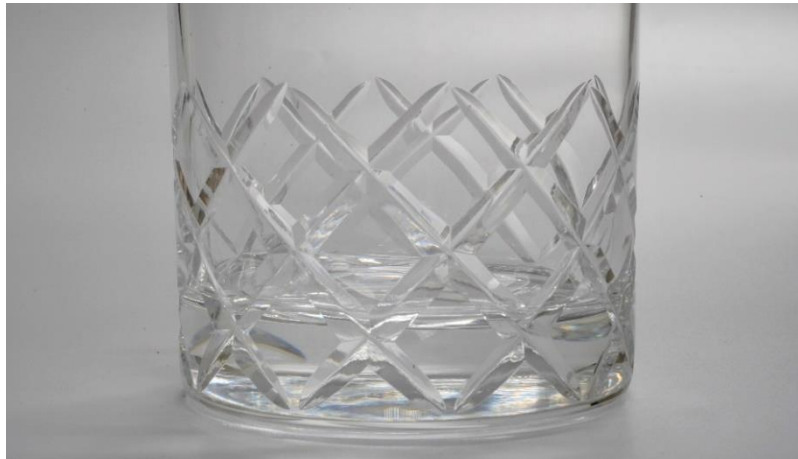
【Modernized Yarai (矢来) cut on bottom half】

<Recipe 1. Improved Whiskey Cocktail by @stevethebartender>