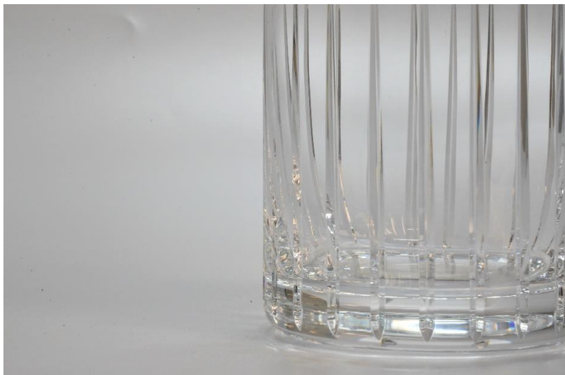
【Straight cut to the very top end】